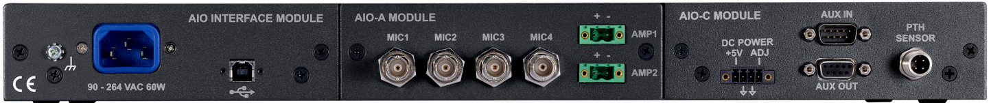
Shown: AIO-AC rear view with A acoustic and C combo test modules. Other configuration combinations available—see chart on back.

The Echo AIO™ test system is a modular audio test platform ideally suited for high-volume production-line testing and QA/QC verification. The AIO combines the functionality of multiple standalone devices into a single, integrated unit, making test stations both more reliable and less expensive.