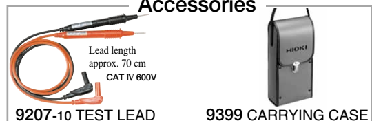
9207-10 TEST LEAD