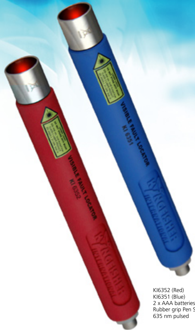
KI6352 (Red) KI6351 (Blue) 2 x AAA batteries Rubber grip Pen Style 635 nm pulsed